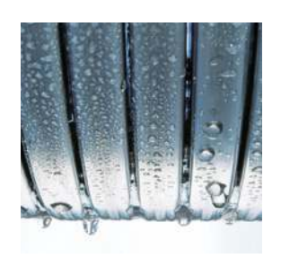
10 Year Warranty on all stainless steel heat exchangers for gas condensing boilers up to 150 kW

With the expansion of its thermal output up to 30.8 kW, the new generation of the Vitovalor PT2 fuel cell heating device offers greater flexibility and more applications, and with its compact design it requires a floor space of just 0.72 square meters. The front mounted controls along with pre-installed components for the energy manager complete this unit. The new 7-inch colour touchscreen display considerably simplifies operation. The unit also features an integrated 220 litre stainless steel