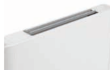
NEMO FLAP OPEN

The inlet flap can be manually adjusted to achieve the best direction for air output. Even with the flap closed, Nemo can operate at super silence speed, providing a smooth, uninterrupted surface.