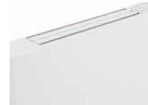
NEMO FLAP CLOSED